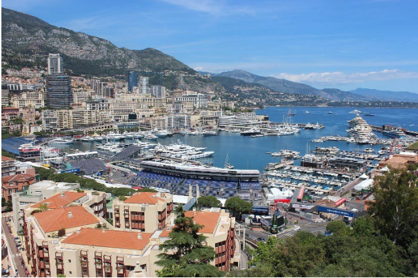
The port of Monaco

$3,425 double occupancy, paid in full by May 2 $4000 single occupancy, $3,050 triple occupancy Signing up after May 2 requires full payment plus $100