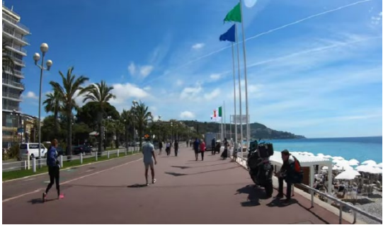
The famous Promenade des Anglais, Nice France